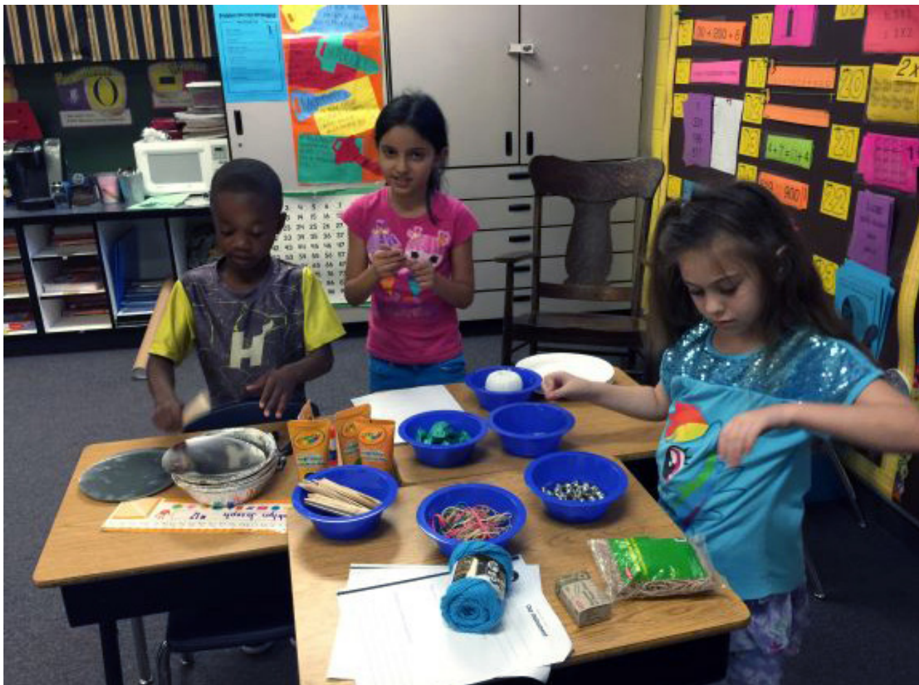
SAE International's AWIM program, funded by the SAE Foundation, reaches over 100,000 students annually.

“Mentor Mixers” has diverse professionals offer their insights on technical and/or “soft” matters. In May, a Mentor Mixer was held on the topic of “Women in Engineering & Effective Communication.” Six distinguished women served as hosts and offered their insights. Ninety comments were posted.