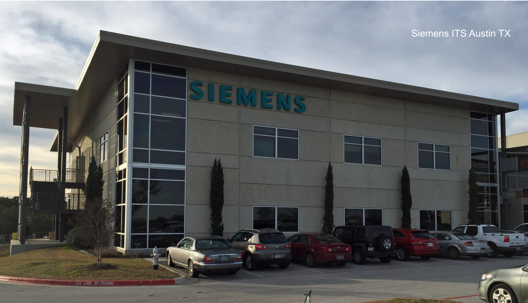
Siemens ITS Austin TX