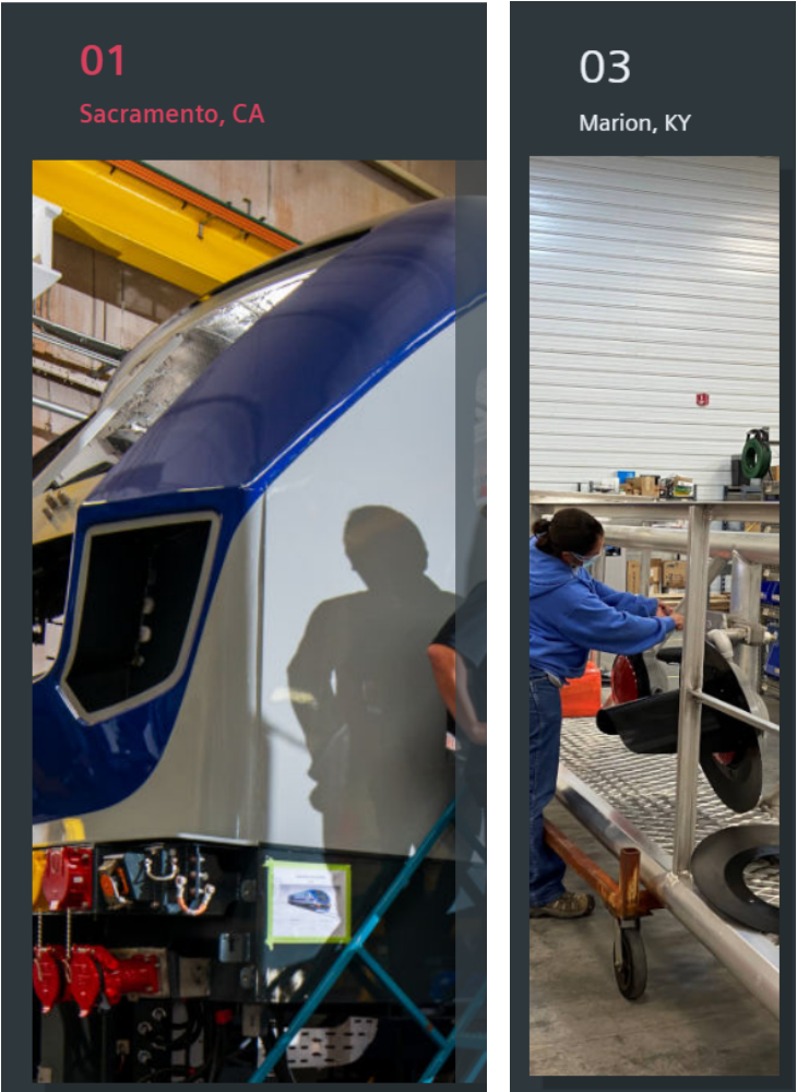
01 Sacramento, CA